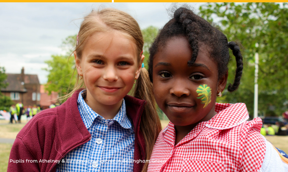
Pupils from Athelney & Elfrida at our pupils in Bellingham Green