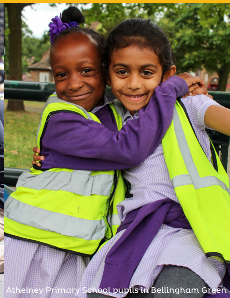
Athelney Primary School pupils in Bellingham Green

"The programme is definitely building positive attitudes, giving our pupils a sense of empowerment to be influential in the type of communities that they want, to look how they want to build positive communities. And that's important because there's a lot of peer pressure for young people."