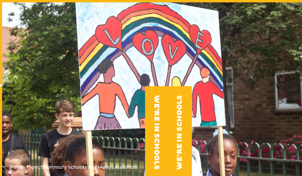
Pupils from 15 primary schools say Hello Lewisham