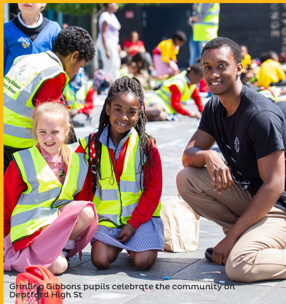
Grinling Gibbons pupils celebrate the community on Deptford High St