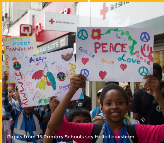
Pupils from 15 Primary Schools say Hello Lewisham