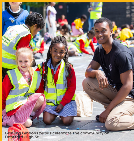
Grinling Gibbons pupils celebrate the community on Deptford High St