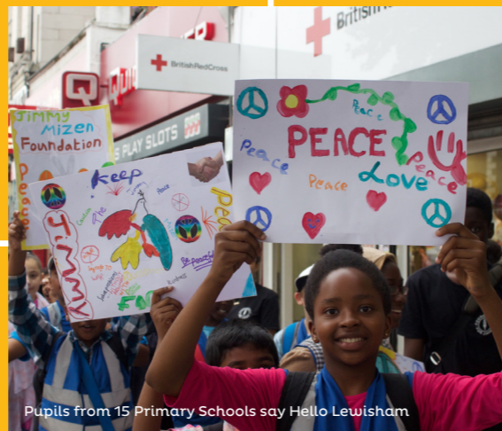
Pupils from 15 Primary Schools say Hello Lewisham