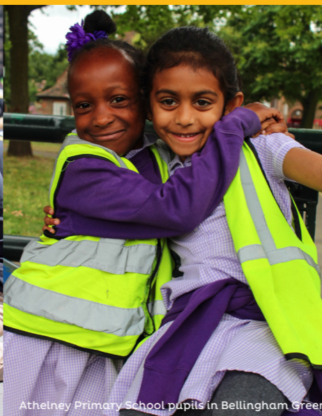
Athelney Primary School pupils in Bellingham Green

"The programme is definitely building positive attitudes, giving our pupils a sense of empowerment to be influential in the type of communities that they want, to look at how they want to build positive communities. And that's important because there's a lot of peer pressure for young people."