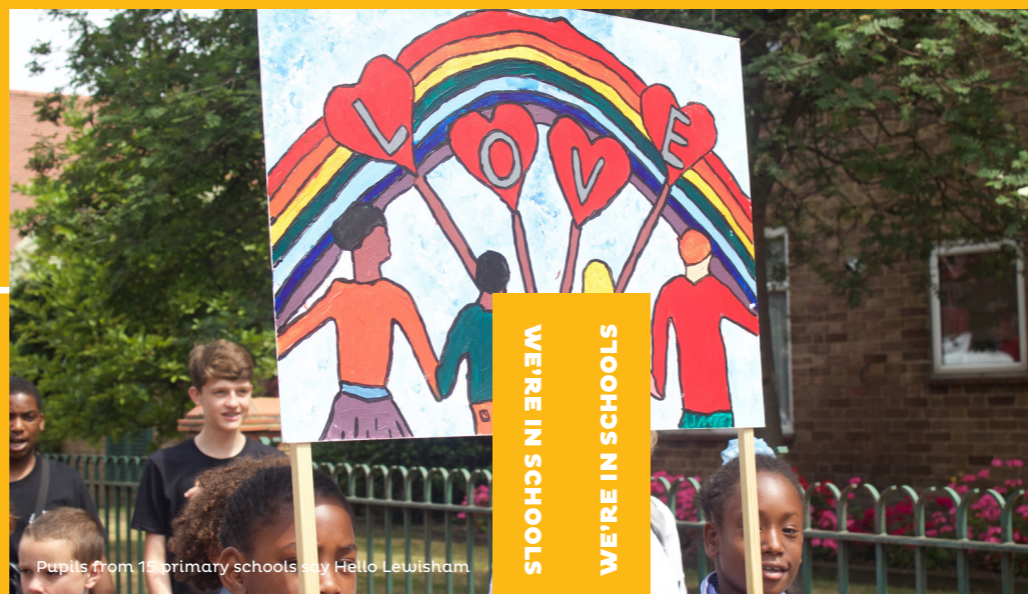
Pupils from 15 primary schools say Hello Lewisham