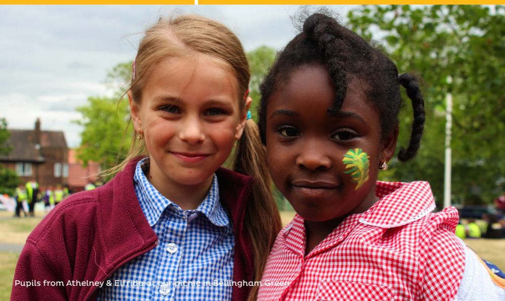
Pupils from Athelney & Elfrida at our points in Bellingham Green