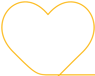
Bellingham Park Mini Sparkle Event - 3rd July 2015

“This has given them more confidence. There’s been a change, they’ve bonded together as a year group. And now I’ve got pupils from every other year wanting to be part of the programme.”