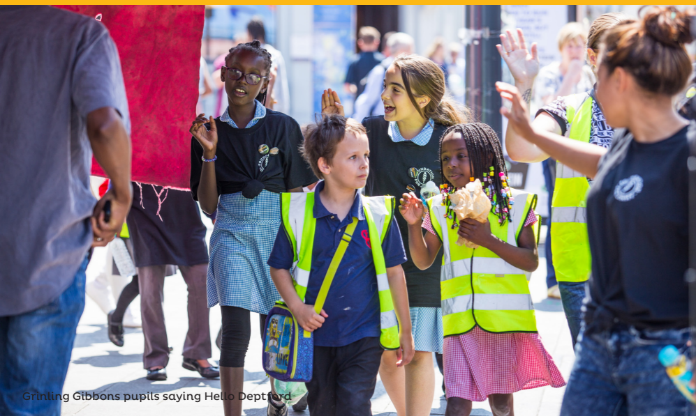
Grinling Gibbons pupils saying Hello Deptford