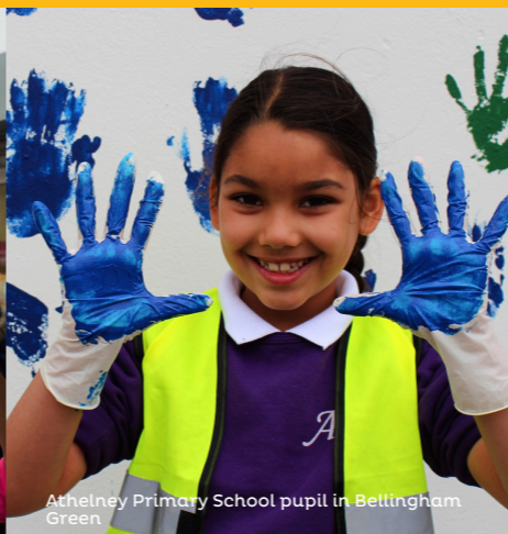
Athelney Primary School pupil in Bellingham Green

"Some of these kids could go down a route that we don't want them to go down, and I know that if schools work on a scheme like this students will be thinking about others and their welfare and it will definitely change things. Yes, in answer to your question I feel that they are a lot safer, I'm a lot safer and if we can work on a programme like this with other schools Lewisham will definitely be safer."